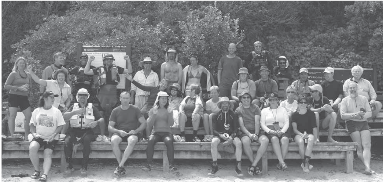
Happy paddlers at the International Kayak Week.