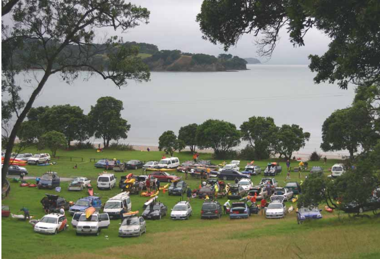
Coastbusters 2008. Top: More kayaks and vehicles at Sullivan's Bay than you could shake a stick at. Below: The handsome/attractive paddler pod who claimed to have won the pod lake challenge