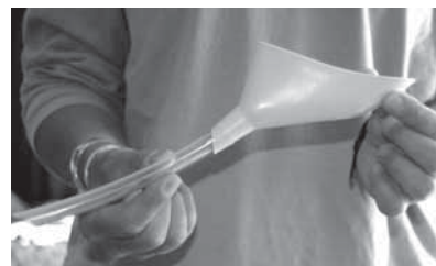
A rare glimpse of an FUD

Discover FUD friendly clothing! Men's clothing has MUD (Male Uri-